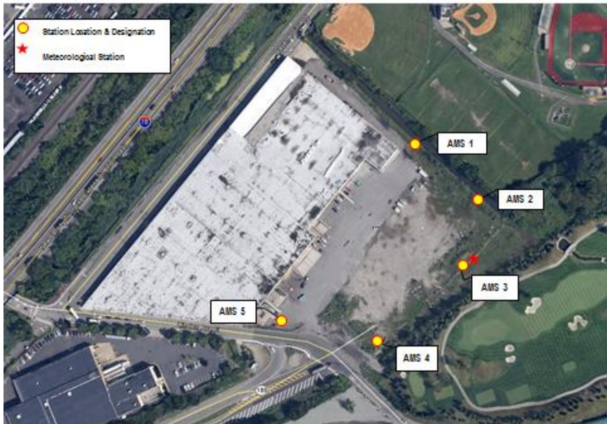
Figure 2: Air Monitoring Station Location Map